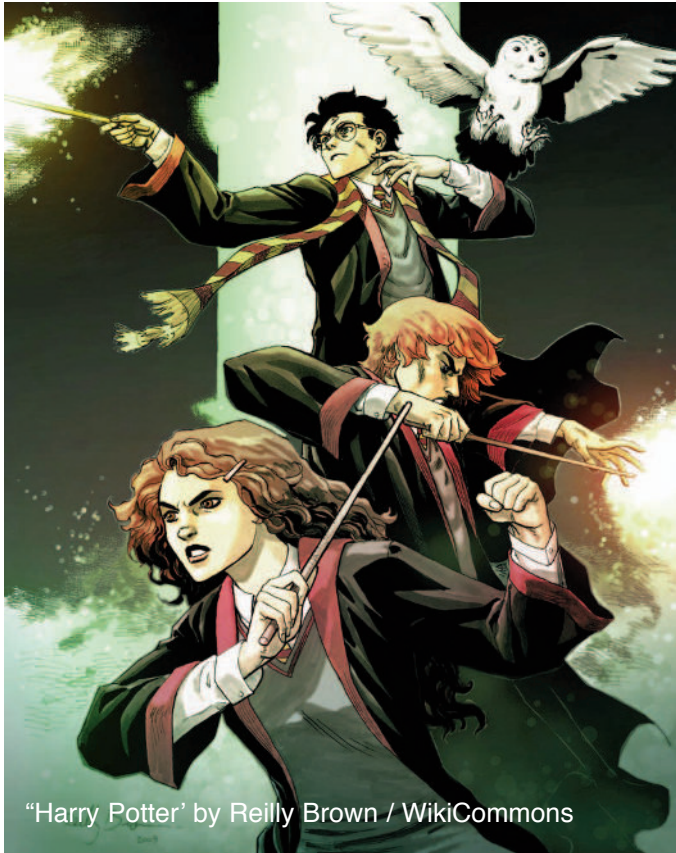
“Harry Potter”

Likewise, Christians two millennia later should recognize that they need not fear the powerless gods of paganism—much less worry about literary references to sorcery and magic.